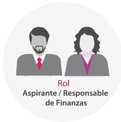
Rol Aspirante / Responsable de Finanzas